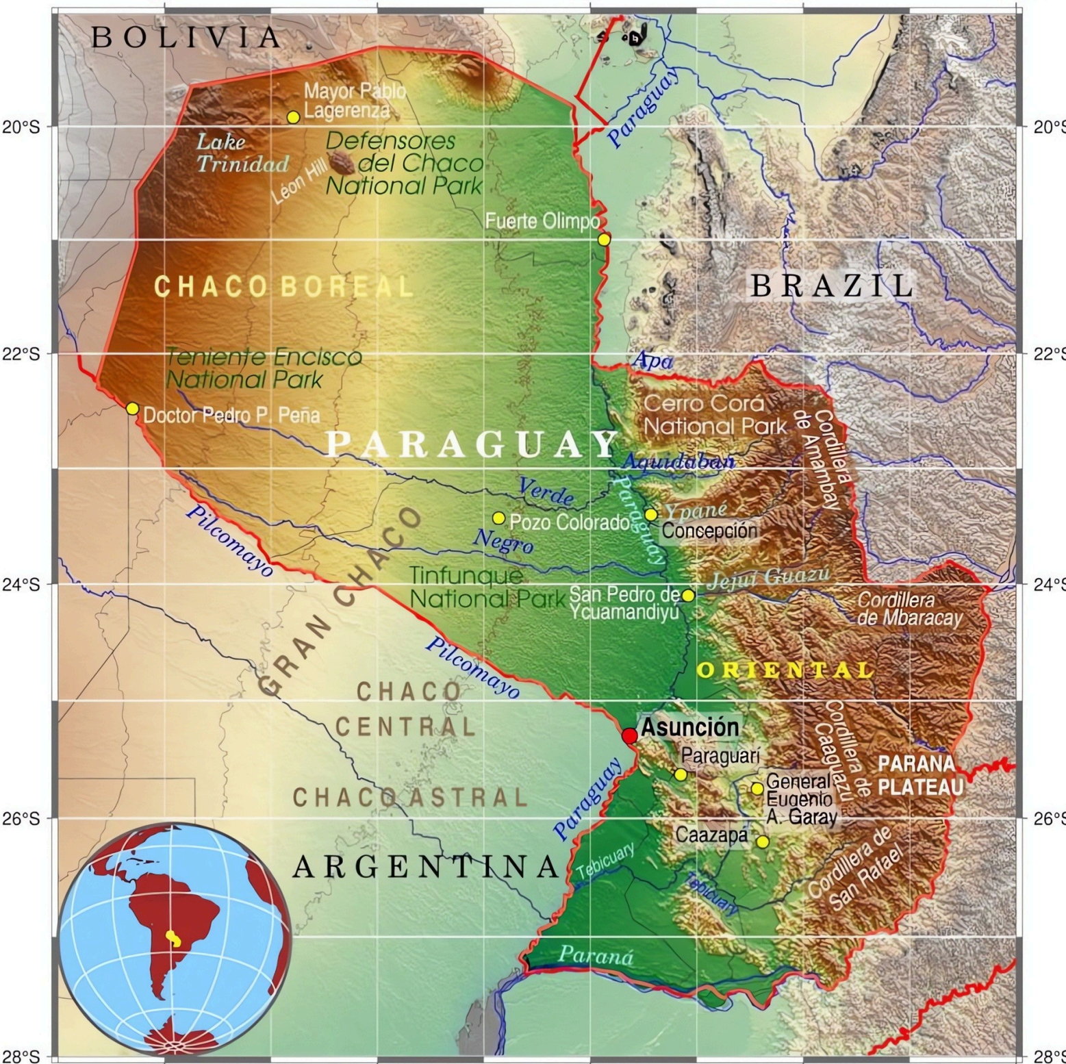
Color scale 'geo': global bathymetry/topography relief [R=-6857/3206, H=0, C=RGB]